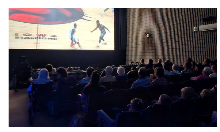
Everyone settled in watching the movie