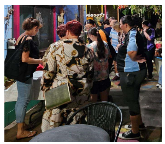
Everyone digging in to the donated food

On Thursday 20 April 2023, Flexi Queensland collaborated with Stardust Drive in Theatre Ayr to fundraise money to 'revamp the TAC'. Everyone who attended received light refreshments and watched the movie premiere "CHAMPIONS". Champions is about a former minor-league basketball coach who receives a court order to manage a team of players with intellectual disabilities. Despite his doubts, he soon realizes that together they can go further than they ever imagined.